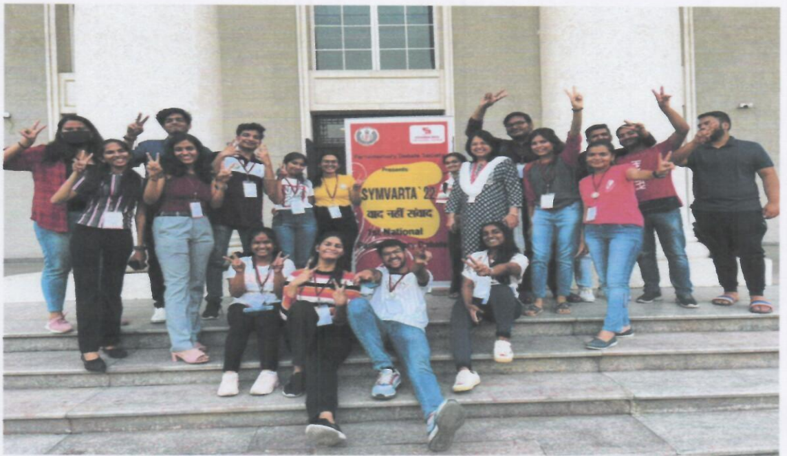
Students relishing the success of the event.